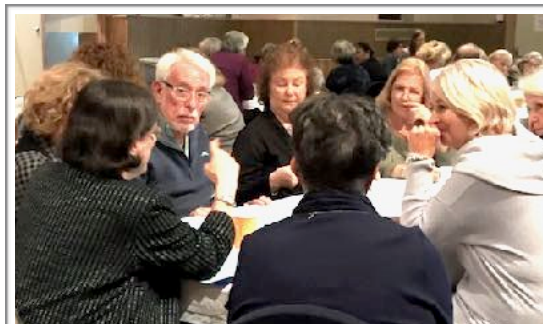
Participants form panels of jurists to discuss and examine a federal case and hand down their verdict—a great learning experience to deepen one’s understanding of the need for a fair and independent judiciary. The event was held at Beth Sholom Synagogue.