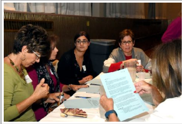
Group pictures of the many beneficiaries of the tireless work of our You Be The Judge Committee.