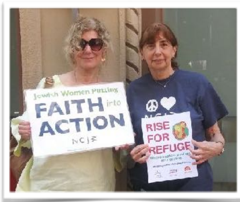
NCJW Philadelphia Section rallies with HIAS in support of refugees.

"A person's most useful asset is not a head full of knowledge, but a heart full of love, an ear ready to listen and a hand willing to help others." (author unknown)