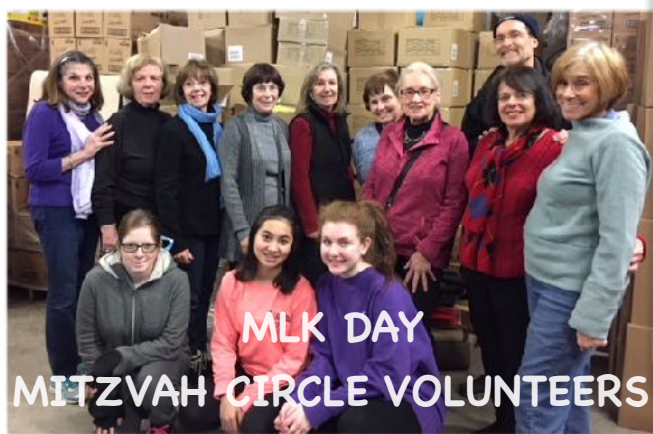
MLK DAY MITZVAH CIRCLE VOLUNTEERS