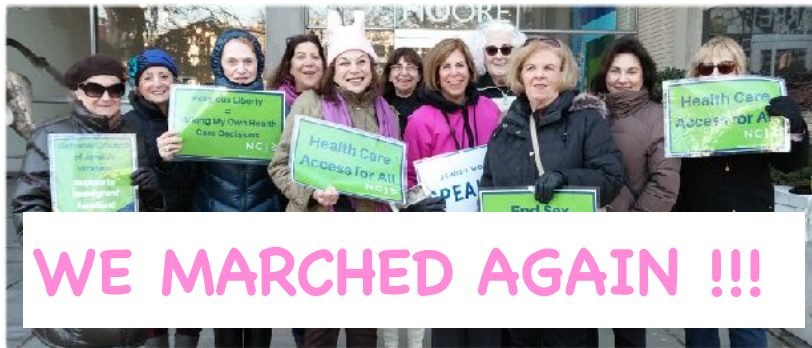
WE MARCHED AGAIN !!!