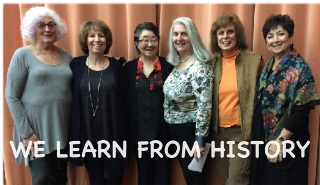
WE LEARN FROM HISTORY