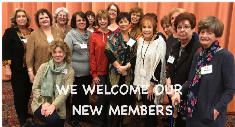
WE WELCOME OUR NEW MEMBERS