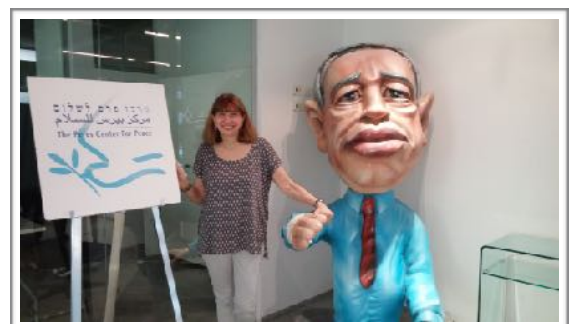
High-level meeting. Lynne with Shimon Peres