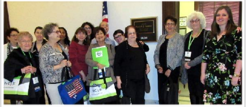
At Senator Toomey's office