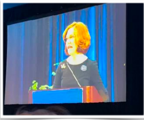
Hearing Incredible Speakers On Crucial Issues For Advocacy