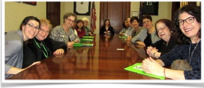
At Senator Casey's office