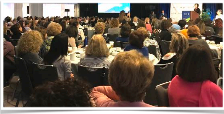
Our Greater Philadelphia Section Delegates Attend Workshops And Discussion Groups