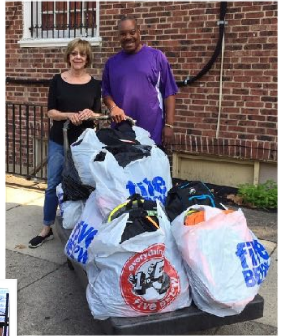
A very full cart of our donations of school supplies that will be of great use to Franklin students.