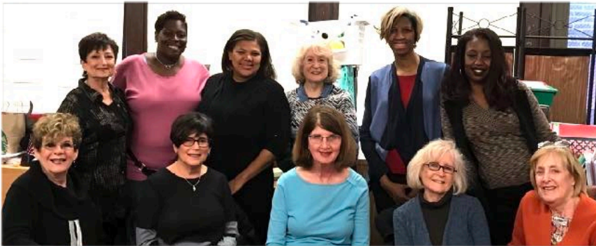
Our volunteer tutors with school staff at Benjamin Franklin Elementary School savoring the impact of our NCJW Section's financial donation on our adopted school's Positive Behavior Incentive System