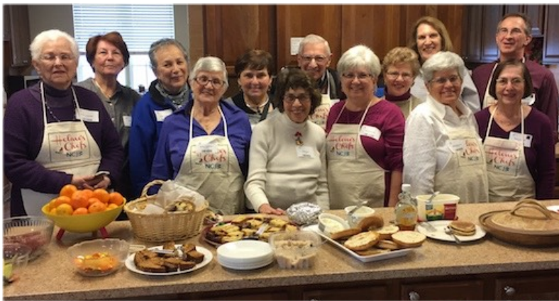
Our members prepared breakfast for patients and their families as part of our NCJW Guest Chef Program at the Philadelphia Ronald McDonald House