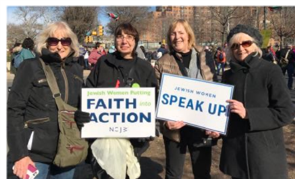
and equal rights for women!