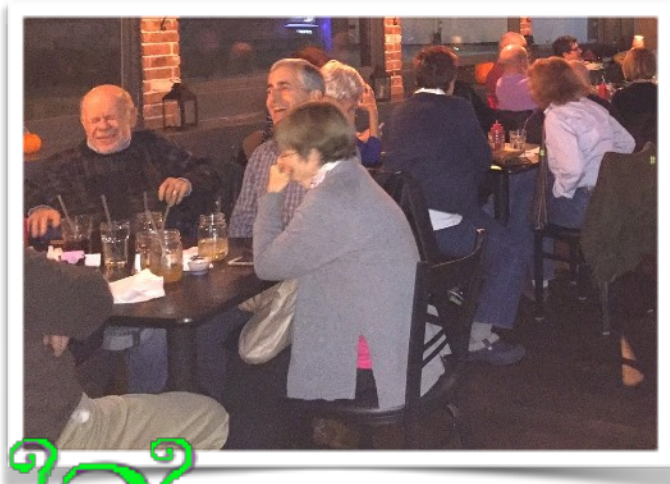
Anyone can be a winner at Trivia Night