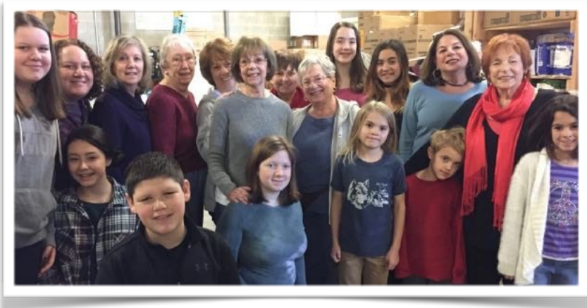
MARTIN LUTHER KING DAY OF SERVICE NCJW volunteers and their grandchildren designed, sorted, and packed treat bags for homeless and needy school children at the Mitzvah Circle Foundation in Harleysville.

Our NCJW section sponsors a Holocaust Essay Contest.