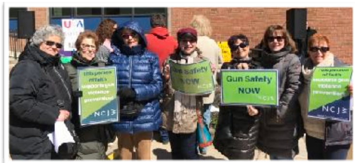
Our members rallied for gun safety...