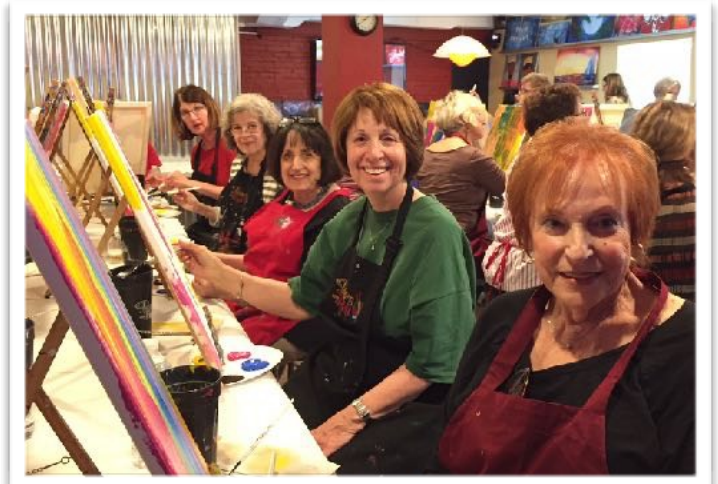
Having fun while bringing out our inner artist at "Painting With a Twist"