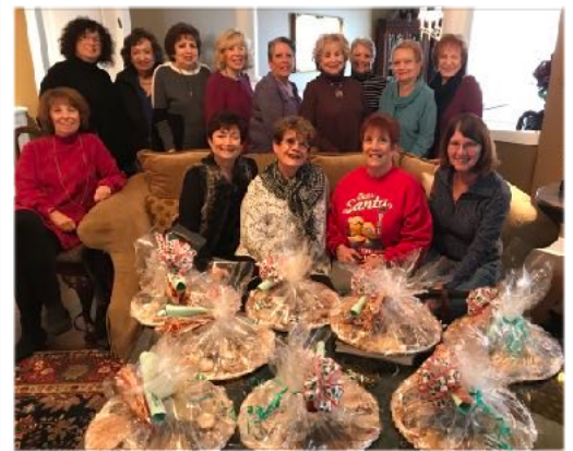
Members assembled and delivered trays of treats to the Good Guys: the police, firefighters and hospital and nursing home employees who work on Christmas Eve.