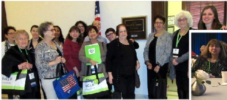
Our delegates at Senator Toomey's office