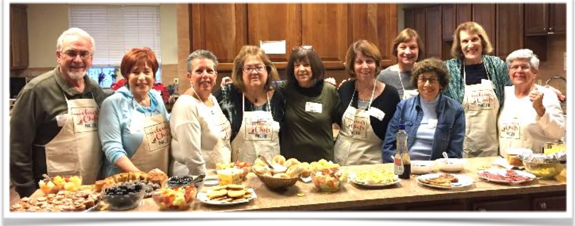
Providing breakfasts to nourish families staying at the Ronald McDonald House while their critically ill children receive treatment at St. Christopher's Hospital.