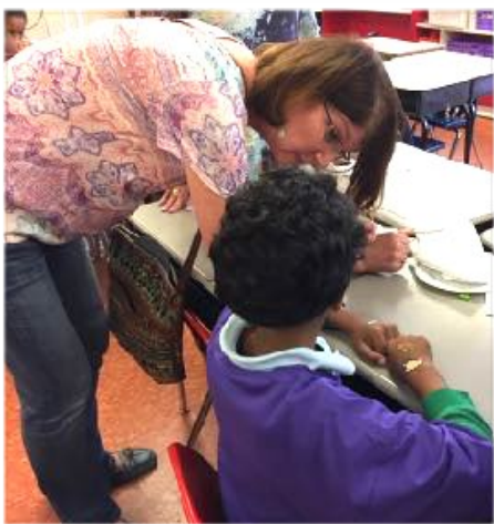
Offering help with academic skills and encouragement.