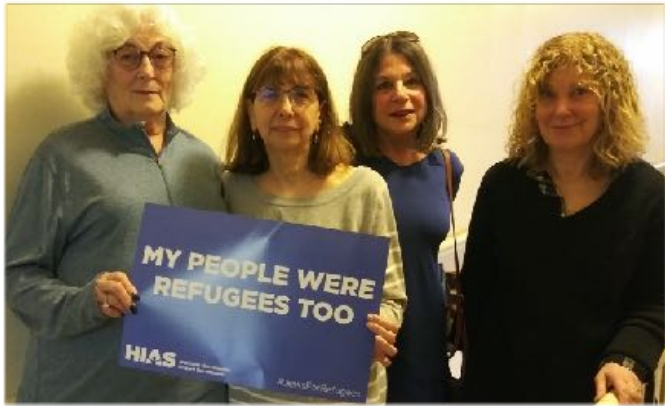
Advocacy Committee members at a HIAS region-wide training on using advocacy to benefit immigrants and refugees.