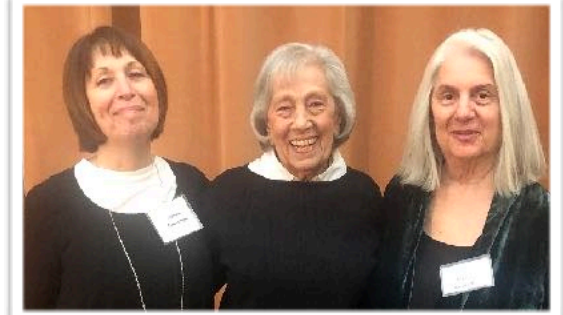
REMEMBERING ANNE FRANK NINETY YEARS LATER