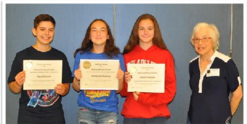
Student winners of our Holocaust Essay Contest sponsored by our NCJW Greater Philadelphia Section.