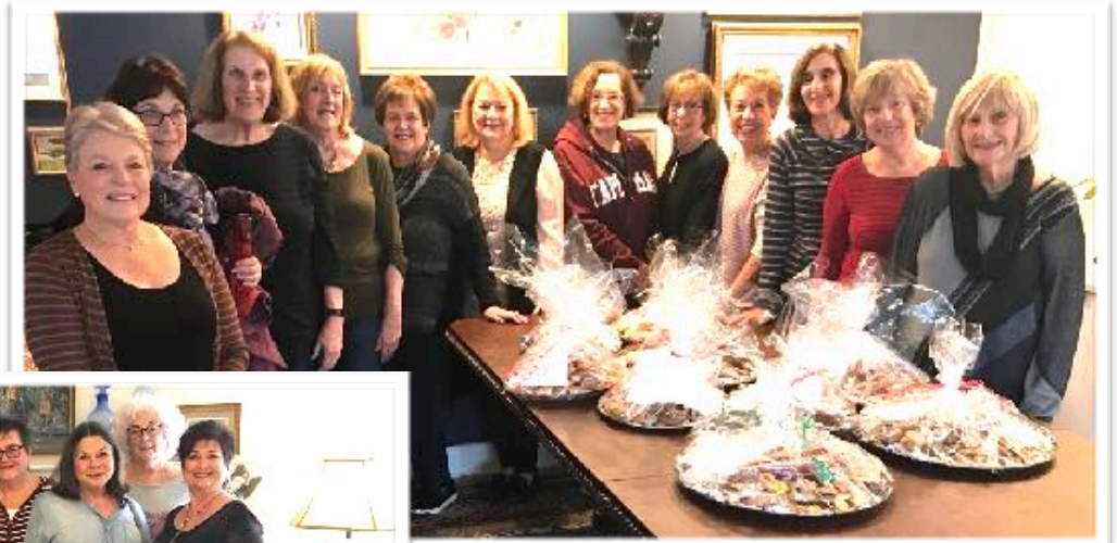
GOODIES FOR THE GOOD GUYS - baked, donated, and assembled by our own NCJW "good guy" volunteers, recognizing first responders and health care providers who work on Christmas.