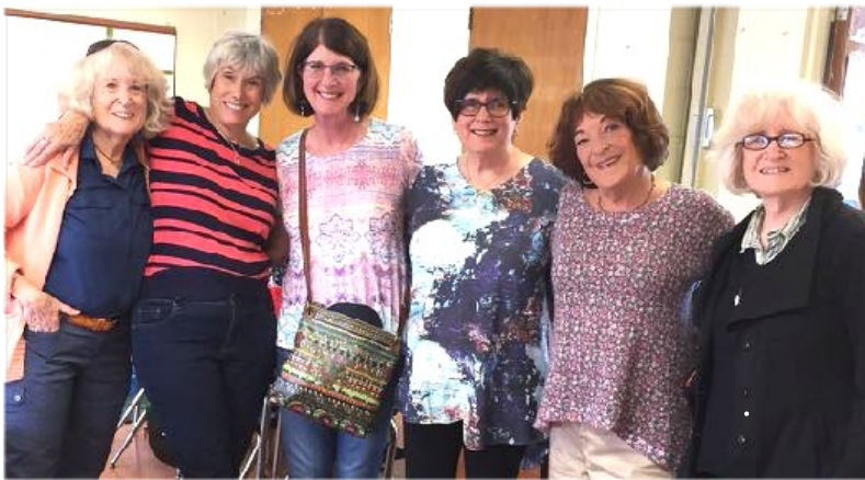
Some of our school volunteers looking forward to our 4th year of tutoring students in our adopted K-8 Philadelphia School, Benjamin Franklin Elementary.