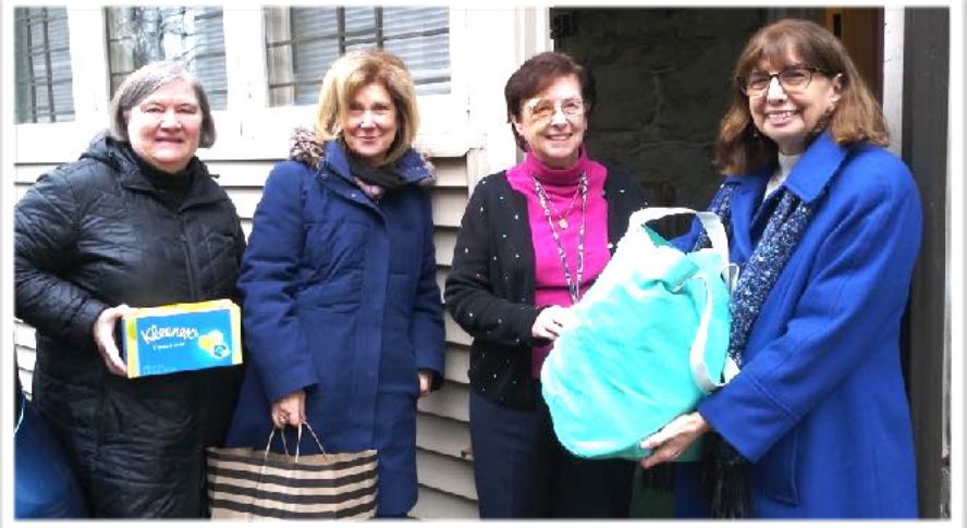
Delivering toiletries and other supplies to victims of sex-trafficking sheltered at Dawn's Place.