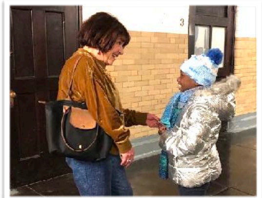
Our section's Community Services program provided warm hats, gloves, and jackets for our students. Here, one of our tutors admires the choice in outerwear of one of her students.