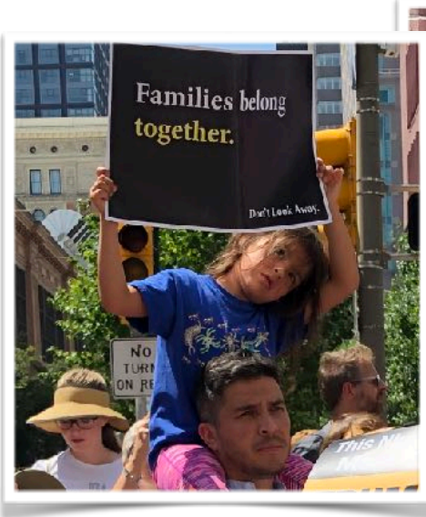
In Center City, a message captured in

NCJW Greater Philadelphia Section members join protest sponsored by Lights for Liberty expressing opposition to the separation and other mistreatment of families at the Southern border. Local rallies were held in three sites in the Greater Philadelphia Region: Doylestown, West Mt. Airy and Center City.