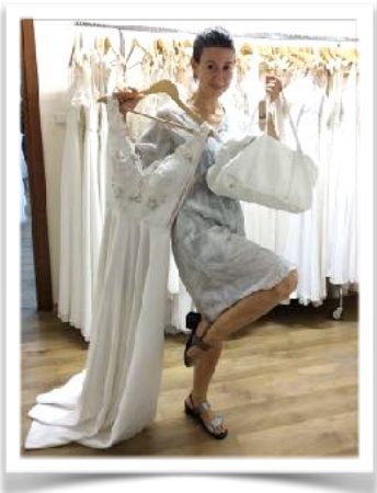
Modeling a gown and bride's tote bag

The Gender Studies Program, Tel Aviv University , a first of its kind in Israel, was endowed by NCJW in 2001. Supporting BA and MA gender study candidates, the program helped to found the very first Alumni Association. The Association encourages Alums to translate their academic learning into projects serving communities, e.g., working with young women at risk, introducing them to concepts of feminism, women's empowerment, and gender equality, and engaging them in activities to expand their horizons.