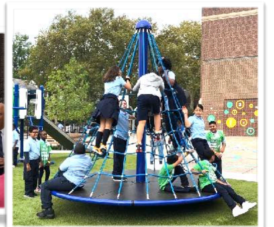
Ben Franklin students, making history, enjoying the first ride on their new playground equipment.