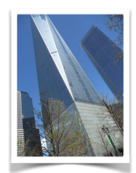
The Freedoms Tower