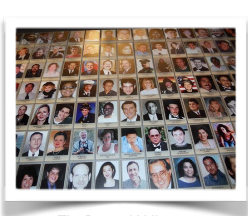
The Picture Wall