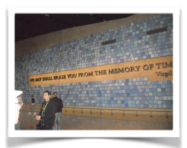
The Memorial Wall where each square represents a victim