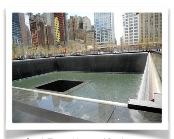
South Tower Memorial Pool