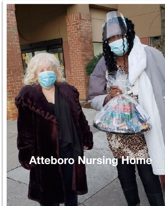
Atteboro Nursing Home