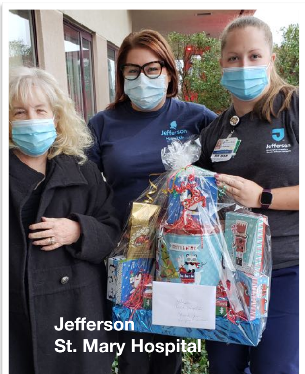
Jefferson St. Mary Hospital