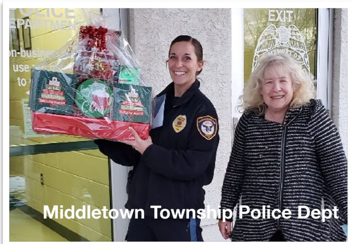
Middletown Township Police Dept