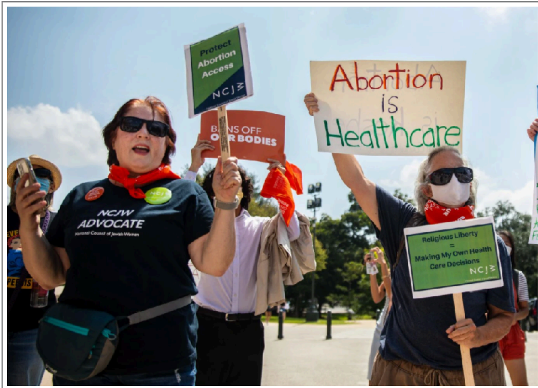
NCJW members demonstrate in Texas

The National Council of Jewish Women is the only Jewish organization focused on REPRODUCTIVE health, rights, and justice. In response to the news that Roe v. Wade is no longer the law of the land in that state," NCJW National is writing an amicus brief to the Supreme Court to highlight the threat to our religious freedom if Roe v. Wade is overturned. Additionally, National is "organizing to pass critical legislation that would reverse the law in Texas and "educating and mobilizing our base of over 200,000 advocates to fight back."