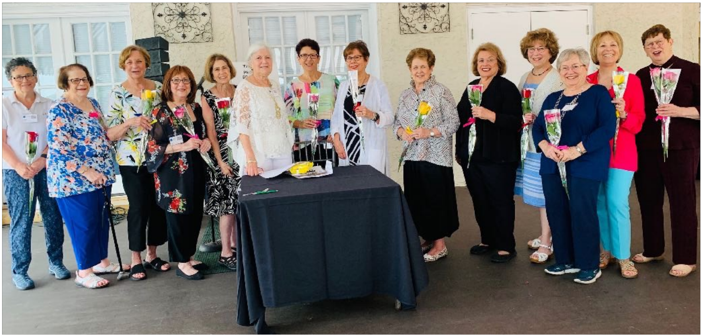
Installation of Officers at our June Luncheon