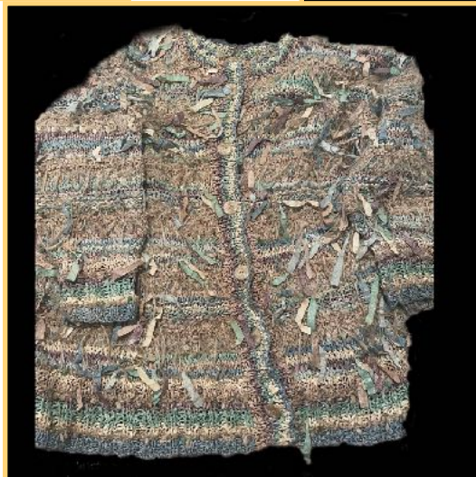
This unique sweater was created with a yarn made of paper.